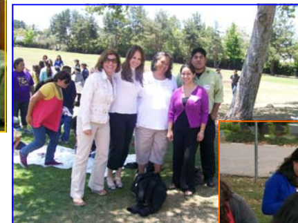
Venoco Inc., employees volunteer during their lunch hour at the Girls Inc. of Carpinteria FITS site.