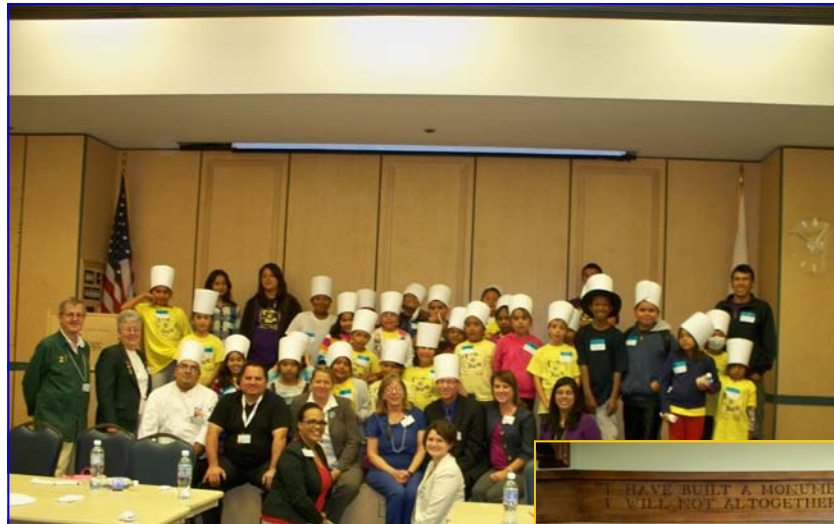
FITS' La Cumbre Jr. High site visits Santa Barbara Cottage Hospital for Lunch Bunch. FITS children learned about the hospital's various operations and procedures, and were introduced to many possible career choices.

Lunch Bunch as a component of Fun in the Sun connects FITS children with hundreds of volunteer adults from the local community. Over 500 individuals from approximately 65 workplaces volunteer to spend a lunch hour chatting, playing, and sharing career stories with the children, while modeling positive adult behavior. This program builds the self-esteem and confidence in each child by showing them that their community cares.