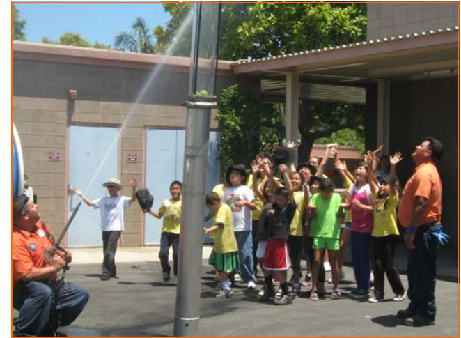
Goleta Sanitary District (GSD) employees show the FITS Goleta Valley Jr. High school site children how their equipment works. GSD volunteers discussed possible career opportunities with FITS participants.