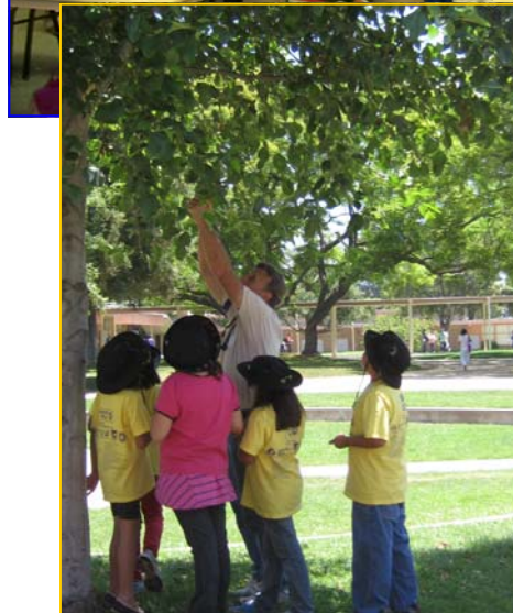
Goleta Valley Beautiful employee teaching FITS children about the important role trees play in our environment at the Goleta Valley Jr. High site.